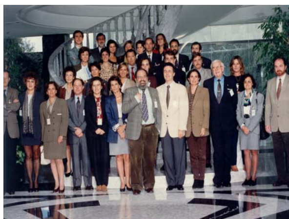
Meeting of Spanish Groups Interested in Alternative Methods Honors Presidency of HM the Queen of Spain October 21, 1997

Red Española de Métodos Alternativos a la Experimentación Animal