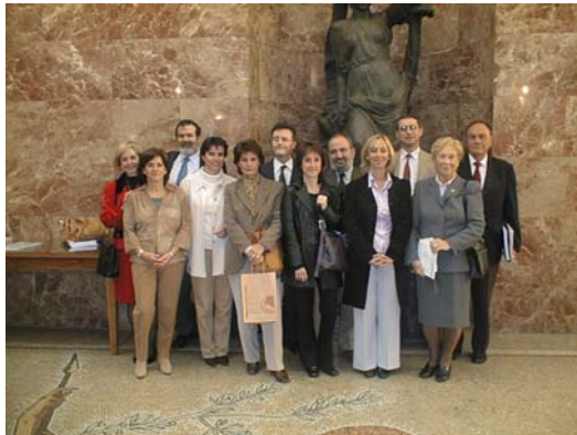
One meeting of the REMA Coordinating Committee